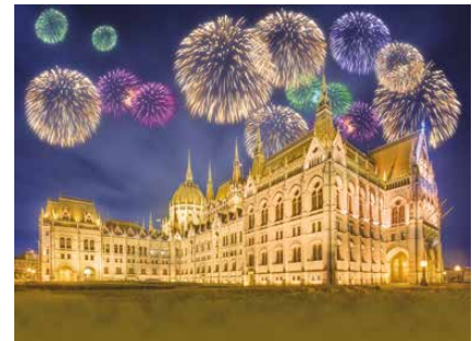
NEW YEAR IN VIENNA

April 29 – May 10, 2023 October 18 – 29, 2023