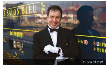
On board staff