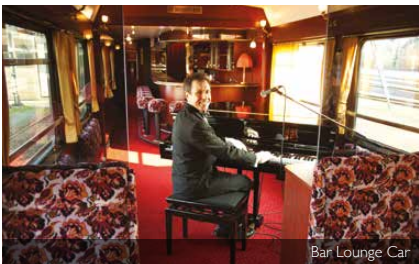
Bar Lounge Car