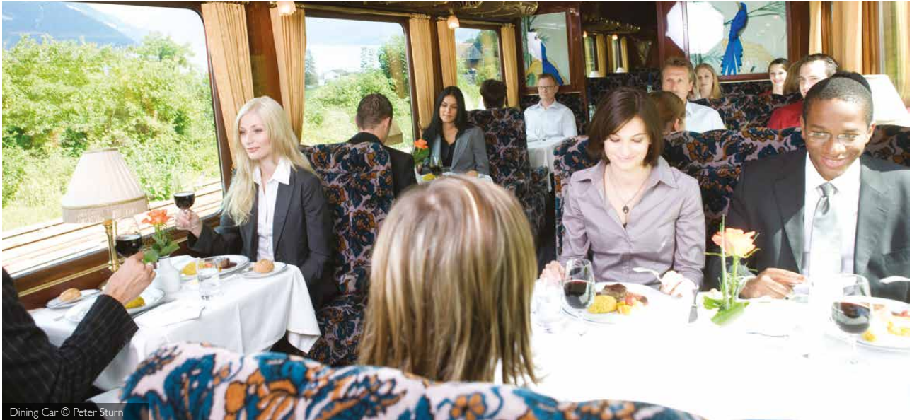
Dining Car