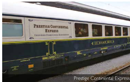
Prestige Continental Express