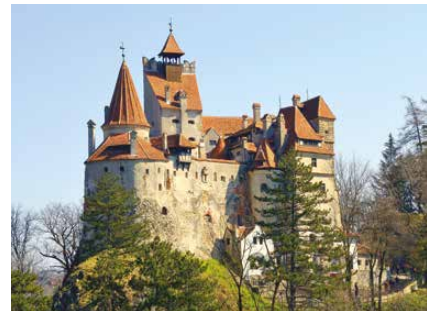
CASTLES OF TRANSYLVANIA