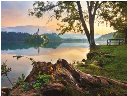
GRAND ALPINE EXPRESS

May 8- May 14, 2023 October 27 - November 2, 2023