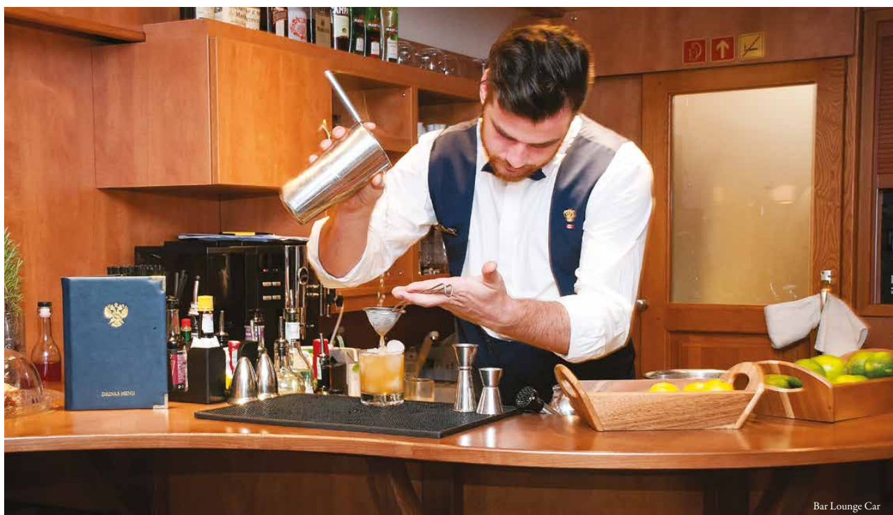
Bar Lounge Car

The social heart of the Golden Eagle Danube Express is the Bar Lounge Car, a great place to relax and settle into the unhurried pace of life on board.