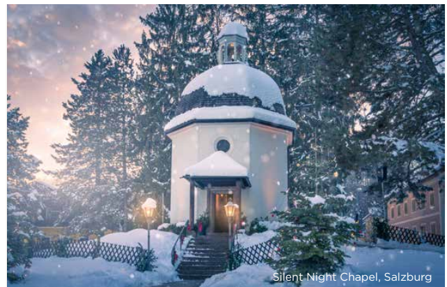
Silent Night Chapel, Salzburg

We return to the train for lunch and from the Restaurant Cars enjoy the spectacular Bavarian scenery as we head across the border into Germany for our final stop in Munich.