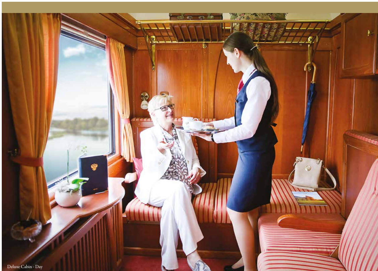
Deluxe Cabin - Day

Travel in some of the finest rail accommodation available in Europe.