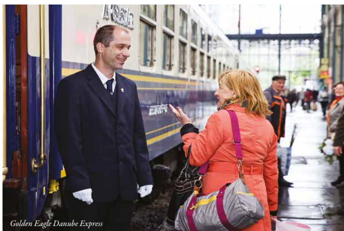
Golden Eagle Danube Express

Our full booking conditions can be found at www.gettrains.com