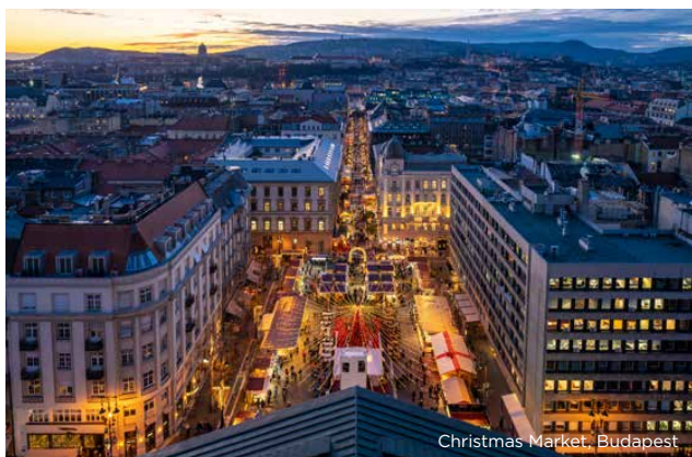
Christmas Market, Budapest

Enjoy a welcome reception dinner in the elegant surroundings of this art nouveau landmark where you can meet your fellow travellers ahead of this highly anticipated journey.